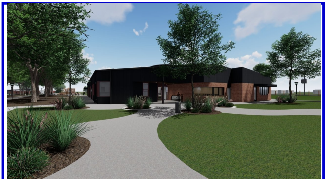
Redevelopment of the Sion Convent concept photos